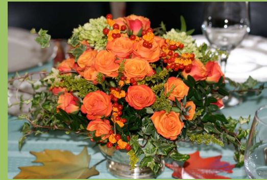
A fall table arrangement that uses garden grown, native and commercially purchased material.

For complete information: http://go.ncsu.edu/artistic-arrangement contact: Liz Driscoll, liz_driscoll@ncsu.edu / (919) 886-3424