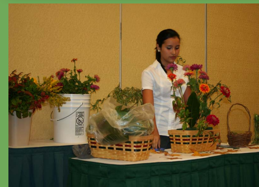
Lee county 4-H'er demonstrating floral design basics at the NJHA convention in Virginia.