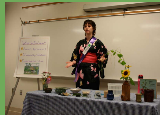
Stokes county 4-H'er demonstrating her interest in the Japanese art of Ikebana.