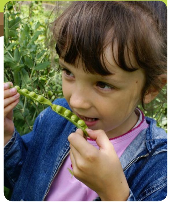
Encourage youth to try something from the garden at least once. You might be surprised at what they like to nibble.