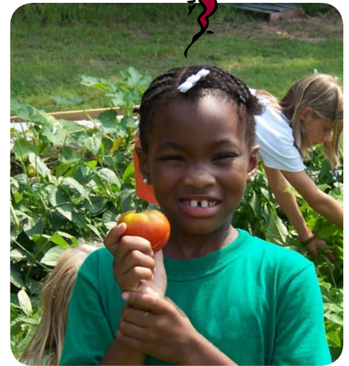
Start a garden program with youth, teaching them how to grow vegetables, edible flowers and herbs.

Before you begin to use this guide, make sure that you read the safety rules presented below under “Grazing Governance.” Also make sure to respect property rights and rules. Be sure you have the property owner’s permission to collect first, even if you are in a public park or other natural area. Collecting of any kind is often prohibited in public places; pay attention to signs, and obey instructions. Remind your group that getting permission and respecting property is an important first step. Be conservative when you graze, especially in wild areas. Take only what you can use, and leave the rest for other grazers, including wildlife.