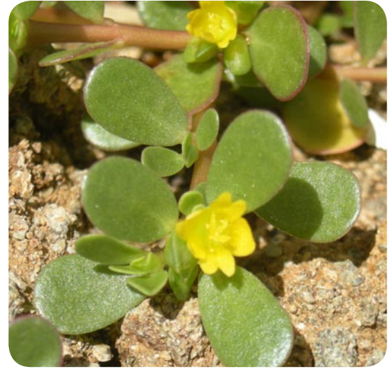
Purslane has a tasty tart flavor and are perfect in salads.