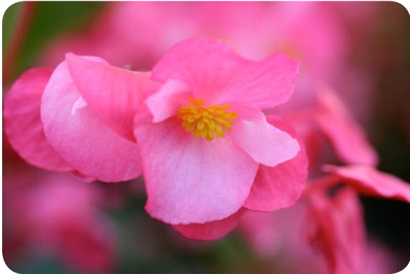
Begonia flowers come in many colors, do you think each color tastes differently?

All of these plants can be easily grown in ornamental gardens. You can also commonly find naturalized patches of daylilies, yuccas and roses in North Carolina, as well as native stands of bee balm, and violets.