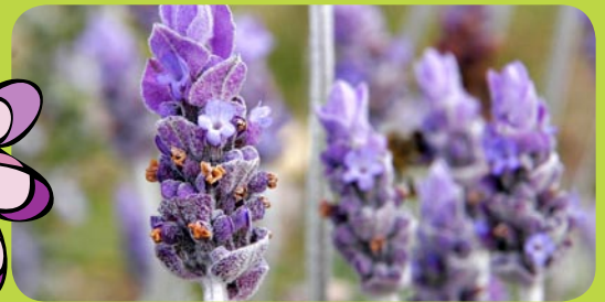
A budded stem of lavender makes a dainty swizzle stick for a summer iced-tea.

Arrange a rack in the middle of the oven and preheat oven to 375°F. Toast pecans in a dry skillet on the stove top until nicely browned. Pour nuts into a food processor with 1 tablespoon of flour. Pulse in 1-second intervals until finely chopped, about 10 seconds. Blend together butter, sugar, vanilla, salt, and pecans with a fork until combined. Whisk together lavender buds and flour. Add small amounts of flour mixture to butter mixture, blending with a fork until a soft dough forms.