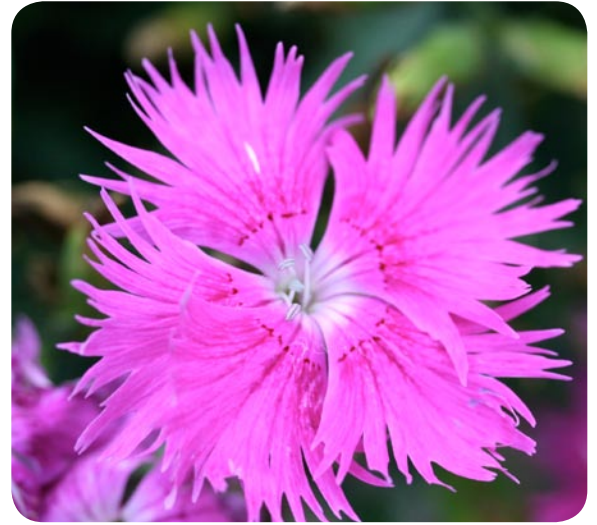
Dianthus is easy to grow and looks great in salads! Flowers come in a range of colors from pinks, reds and whites.

Daylily ( Hemerocallis spp. ) – Daylily petals have a crunchy and crisp texture with slightly sweet flavor. Remove the bitter white base of the flower. The flowers are great to stuff like squash blossoms. NOTE: Many lilies (particularly Asiatic lilies) contain alkaloids and are NOT edible. Daylilies may act as a laxative. Do not eat too many!