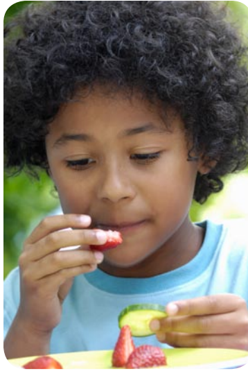
Encourage kids to harvest their snacks from the garden.