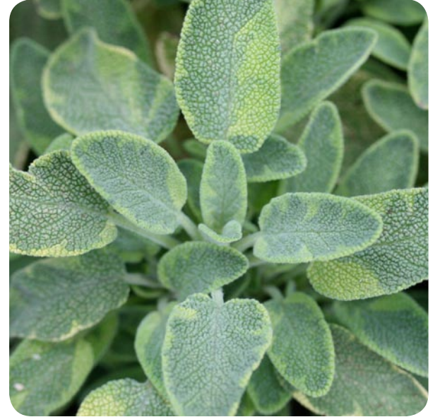
Use sage leaves to brush your teeth and flavor poultry!

Sage ( Salvia officinalis ) – Use sage leaves as a toothbrush after garden grazing. Pick a leaf, and rub it on your teeth. When you are done, simply compost in the garden. Show everyone your pearly whites – sage is said to whiten teeth.