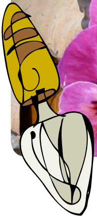
Pansies are very tolerant of cooler weather, providing a harvest of edible blooms throughout the spring and fall.

Their mild and slightly sweet taste is perfect to garnish salads and soups.