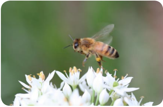
Garlic Chive blossoms are not only tasty for humans but provide nectar and pollen for foraging honeybees.

Chive ( Allium schoenoprasum , A. tuberosum ) – Chive blossoms have a fierce onion flavor, while garlic chive blossoms offer a mild garlicky explosion. Nibble on individual flowers. Serve them whole as a garnish on poultry or seafood. They add a pinkish hue to herbal vinegar. Put blossoms in a jar, add white vinegar, seal, and steep for 5 days. Strain and save to use for salad dressings.