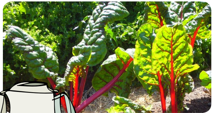
Swiss Chard ‘Bright Lights’ has marvelously colorful stems that are great to cook in the same water alongside your pasta.

Dinosaur Kale ( Brassica oleracea ‘Lacinato’) – This kale has a fantastic name that describes its vigorous growth, broccoli-like taste, and cool bumpy texture.