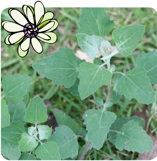
Lamb's quarters are a delicious addition to any dinner!

Swiss Chard ( Beta vulgaris subspecies cicla ) – Swiss chard has a very earthy flavor. Great to use the leaves for wraps; steam or dip leaves into boiling water, and fill with couscous or rice, add raisins, and toasted pine nuts. Bon appetit! Plant the cultivar ‘Bright Lights’ for a chard with colorful stems in red, yellow, orange, and pink. The stems are delicious cooked with pasta.